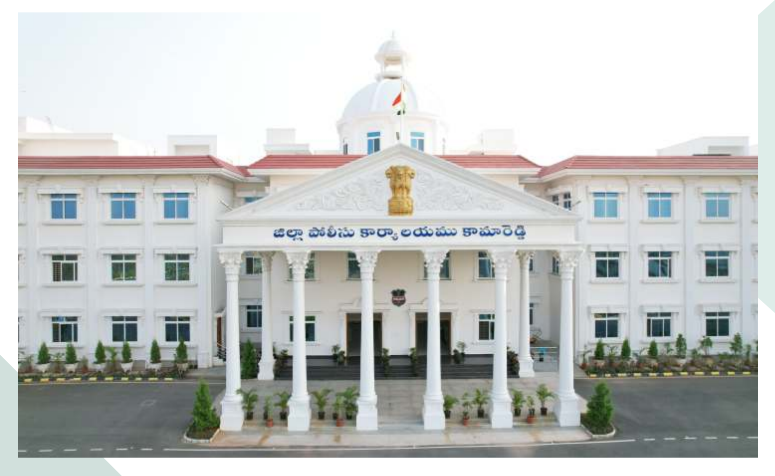
District Police Headquarters (SP Office), Kamareddy

The SP Office is Just 5 Minutes from Dharani Township